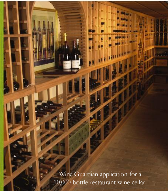
Wine Guardian application for a 10,000-bottle restaurant wine cellar

Completely self-contained and made using the highest-grade materials, Wine Guardian® ductable systems are the most versatile cooling systems on the market. They provide optimal temperature and humidity control for both commercial and residential cellars with a design that allows for easy installation. Many of the system's features and options are unique to the Wine Guardian brand, known around the world for superior performance and reliability in wine room conditioning. With Wine Guardian you can be assured you are creating the perfect environment for the preservation of your collection of fine wine.