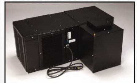
System shown with optional integrated humidifier